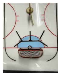
Freeze Ok Fig. 4