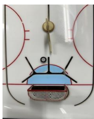
Freeze Ok Fig. 3