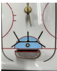
Must Play Fig. 2