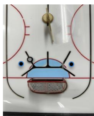
Must Play Fig. 1