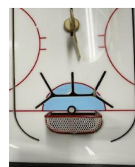
Freeze Ok Fig. 4