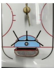
Must Play Fig. 2