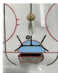
Freeze Ok Fig. 3