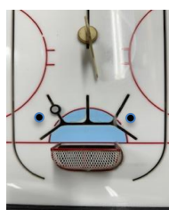
Must Play Fig. 1